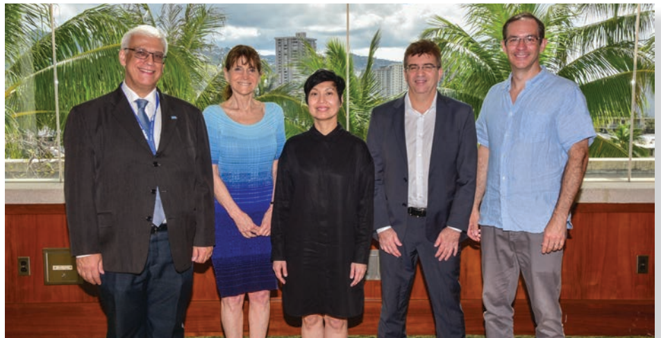
ARRS and CBR leaders meet to discuss the global partnership.