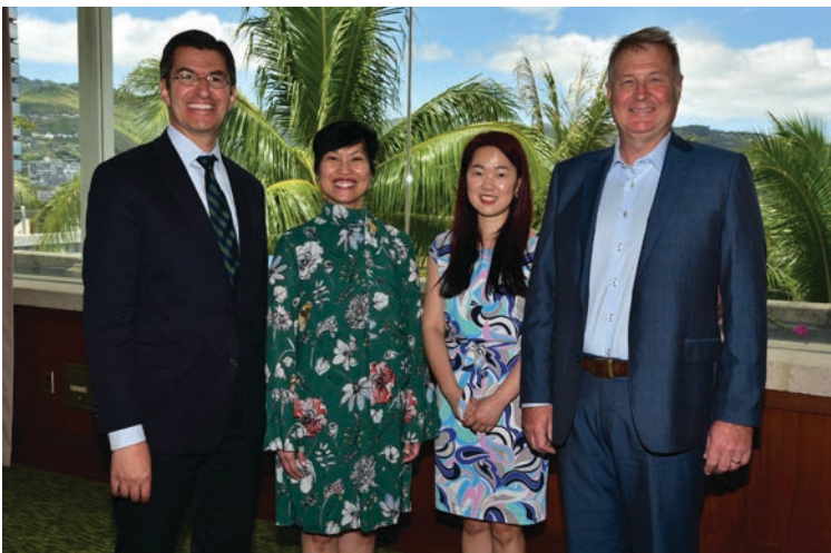
ARRS meets with global partner, RANZCR, during 2019 Annual Meeting.