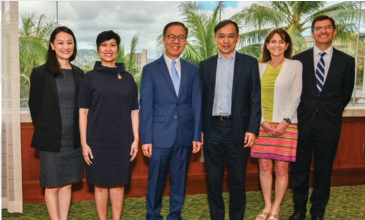
ARRIS and CTSR meet to discuss their global partnership.