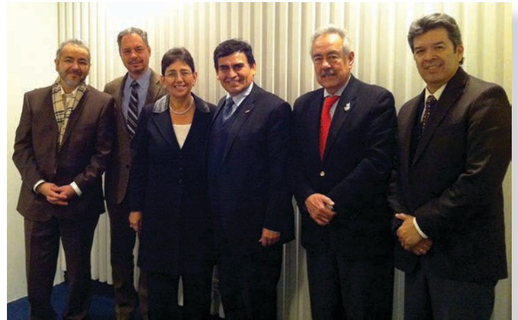
ARRIS and SMRI established a global partnership in 2015.