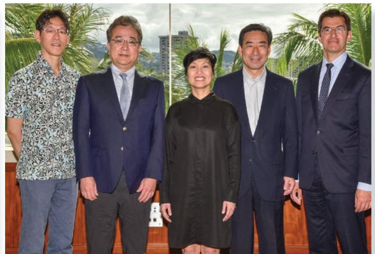
ARRS and JRS established a global partnership in 2011.