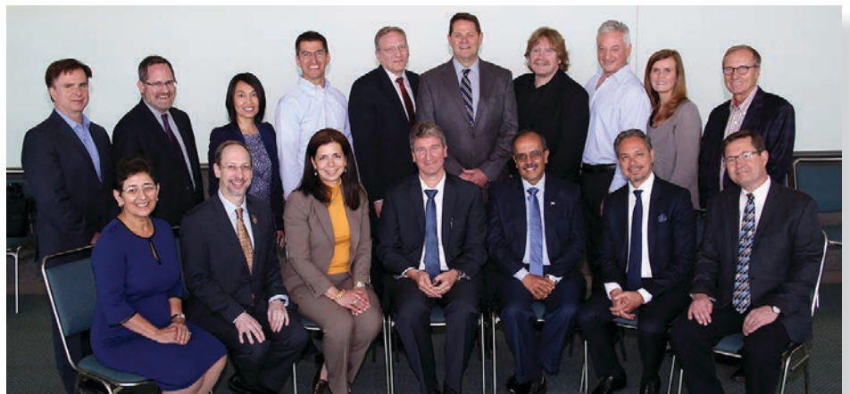
ARRS and ACR leaders collaborate on global partnership.