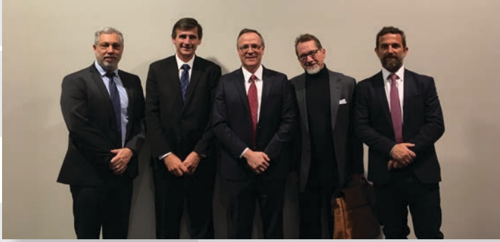
Leaders celebrate a successful Global Exchange featuring Argentina.