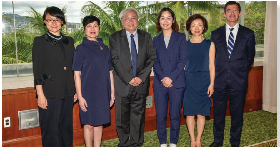
ARRS and CSR leaders collaborate on their global partnership.

The ARRS International Outreach Committee annually reviews the GPS Program and considers new partnerships.