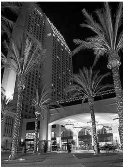
Manchester Grand Hyatt San Diego