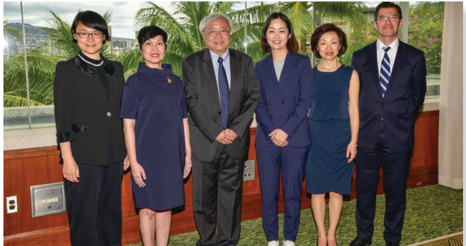
ARRS and CSR leaders collaborate on their global partnership.

The ARRS International Outreach Committee annually reviews the GPS Program and considers new partnerships.