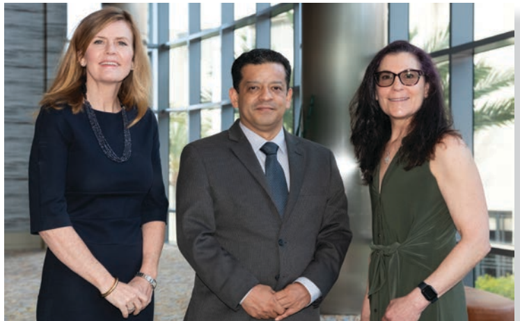
ARRS leaders welcome SMRI President.