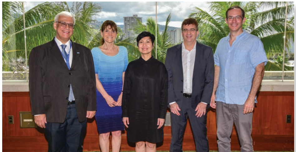
ARRS and CBR leaders meet to discuss the global partnership.