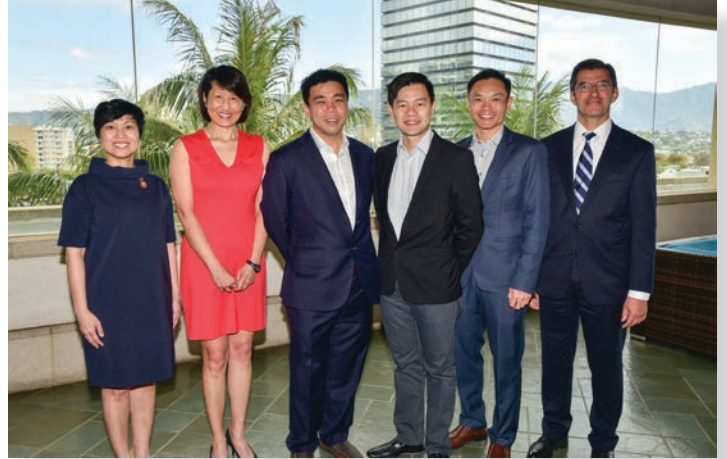
SRS participated in the ARRS 2019 Global Exchange featuring Asia in Honolulu.