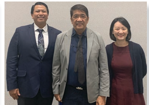
ARRS welcomes its newest global partner, the Philippine College of Radiology.