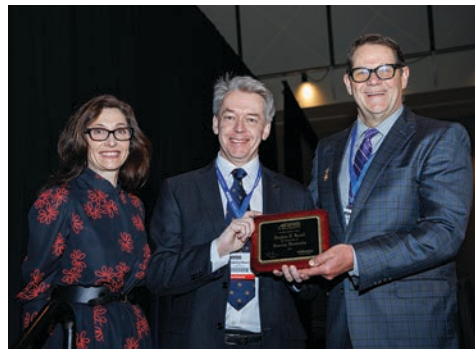
ARRS Honorary Membership was bestowed to the BIR President during the 2024 Global Exchange featuring the United Kingdom.