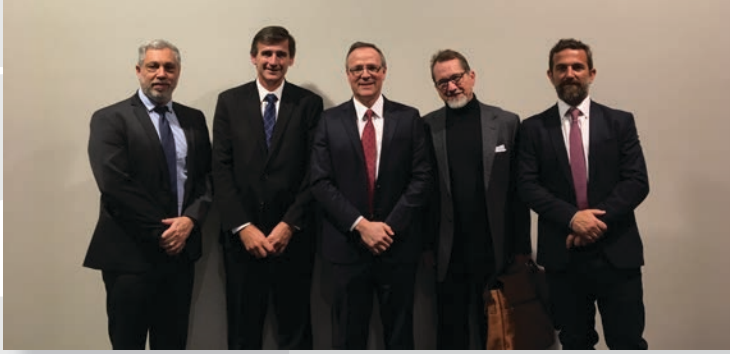
Leaders celebrate a successful Global Exchange featuring Argentina.