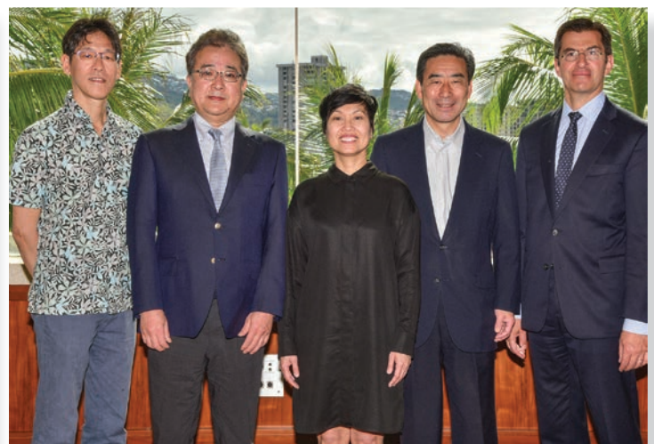
ARRS and JRS established a global partnership in 2011.