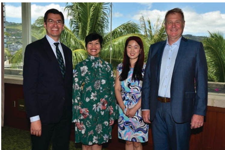
ARRS meets with global partner, RANZCR, during 2019 Annual Meeting.