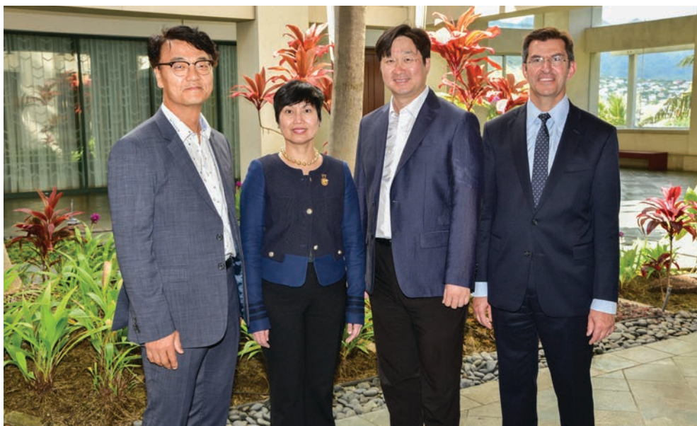
ARRS and KSR established a global partnership in 2008.