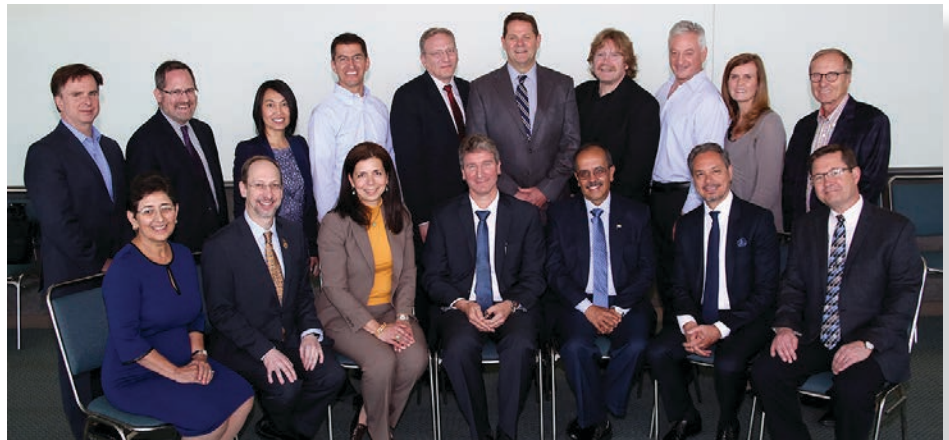
ARRS and ACR leaders collaborate on global partnership.