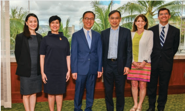
ARRS and CTSR meet to discuss their global partnership.